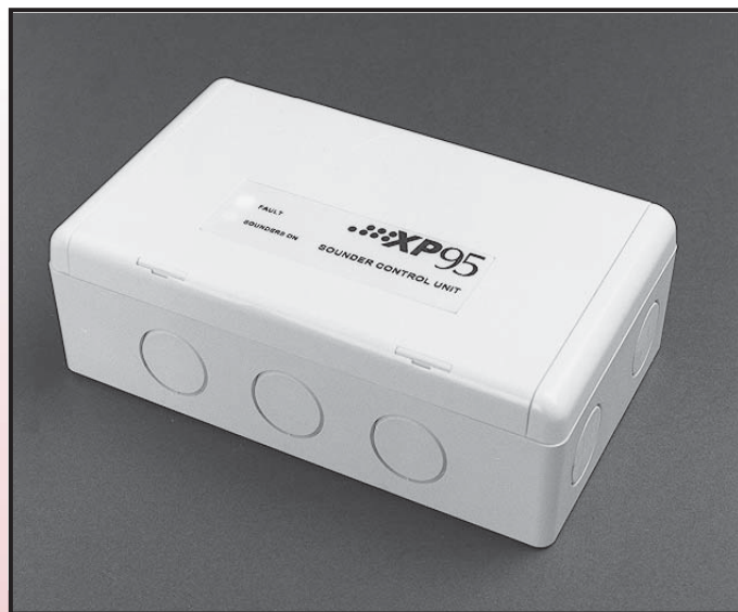
Part no 55000-823

A polarising diode is required with each alarm device, as sounders are operated by voltage reversal, provided by a double-pole change-over relay. The sounder circuit is protected by a miniature (TR5) fuse rated at 1A.