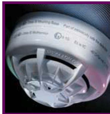
Above: Apollo's Orbis® IS conventional range for smaller installations.

Concludes John: "With Apollo's support, we were not only able to meet the client's specification, but could also demonstrate to Wallop Defence Systems how the Apollo IS devices would work in practice."