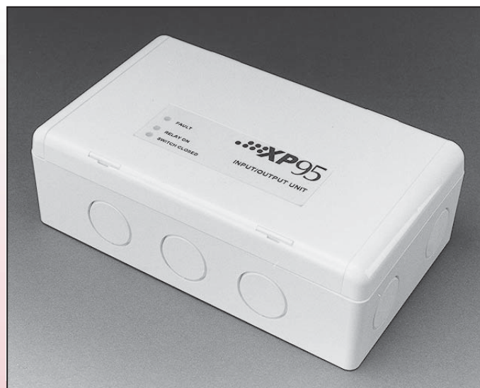
Part no 55000-818 (surface mount)

When output bit 0 is set to logic 1 on two or more consecutive pollings, the relay changes state to the "set" condition. Bit 0 must be set to logic 1 as long as it is desired to keep the relay in its set state. The relay will remain latched in the set state until output bit 0 is set to logic 0 on two or more consecutive pollings. Neither the removal of loop power nor the discontinuation of interrogation of its address will affect the state – set or not – of the relay.