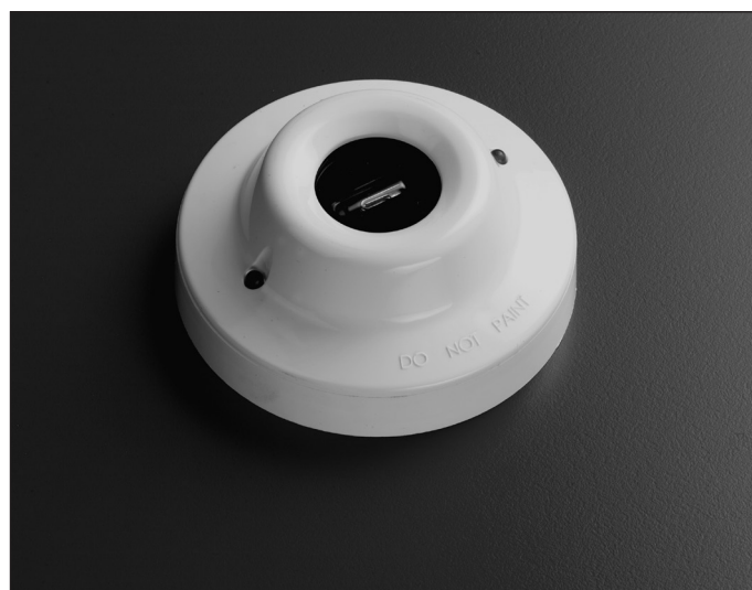
Part no. 55000-026MAR

The alarm current also illuminates the detector's integral LEDs. A remote indicator connected between the L1 IN terminal and the -R terminal will have a voltage equal to the supply voltage less 1V across it and so will illuminate.