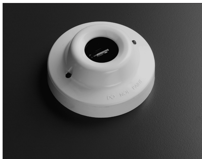
Illustration shows Marine UV Flame Detector

Caution: The detector will also detect electrical discharges from lightning or arc welding.